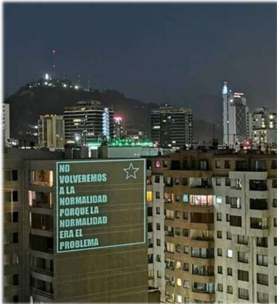
We won't go back to normal because normal was the problem

The "old normality" in Latin America, although today it produces nostalgia in many, was not a rose garden, as described in the introduction of this document. Moreover, this "old normality" could be attributed to the emergence of the COVID-19 pandemic as a result of environmental deterioration, uncontrolled globalization and consumption, global warming, and genetic mutations resulting from interventions in nature and its life cycles.